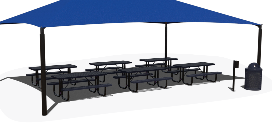
Table Environment $9,165 REG. PRICE $10,782

Product No.: Classroom Sale Package 1 Includes: